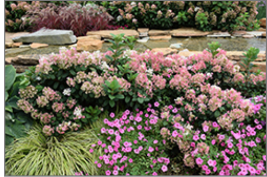
Little Quick Fire Hydrangea in bloom

Little Quick Fire Hydrangea makes a fine choice for the outdoor landscape, but it is also well-suited for use in outdoor pots and containers. With its upright habit of growth, it is best suited for use as a 'thriller' in the 'spiller-thriller-filler' container combination; plant it near the center of the pot, surrounded by smaller plants and those that spill over the edges. It is even sizeable enough that it can be grown alone in a suitable container. Note that when grown in a container, it may not perform exactly as indicated on the tag - this is to be expected. Also note that when growing plants in outdoor containers and baskets, they may require more frequent waterings than they would in the yard or garden. Be aware that in our climate, most plants cannot be expected to survive the winter if left in containers outdoors, and this plant is no exception. Contact our experts for more information on how to protect it over the winter months.