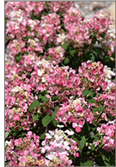
Little Quick Fire Hydrangea flowers

Little Quick Fire Hydrangea is recommended for the following landscape applications;