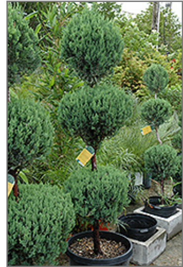
Blue Point Juniper (topiary form)

This shrub should only be grown in full sunlight. It is very adaptable to both dry and moist growing conditions, but will not tolerate any standing water. It is not particular as to soil type or pH. It is highly tolerant of urban pollution and will even thrive in inner city environments. This is a selected variety of a species not originally from North America.