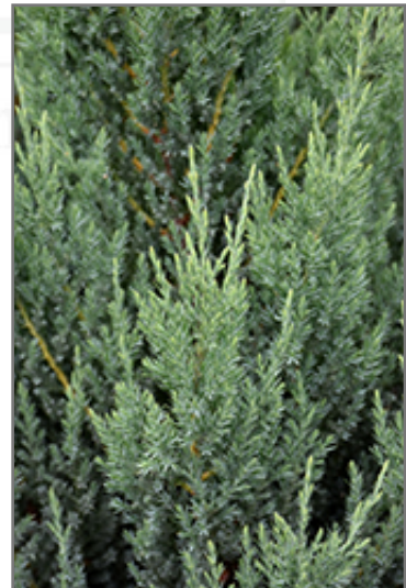
Blue Point Juniper foliage