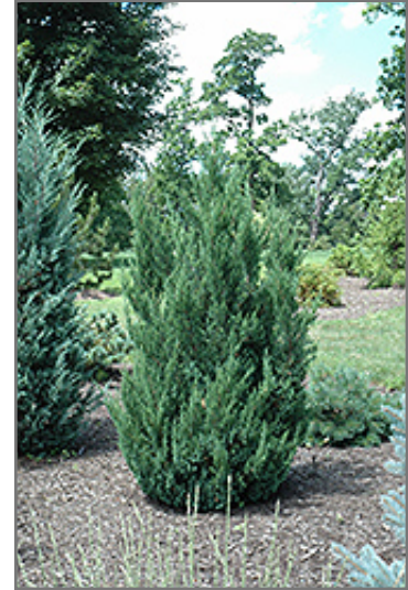
Blue Point Juniper

Blue Point Juniper is recommended for the following landscape applications;