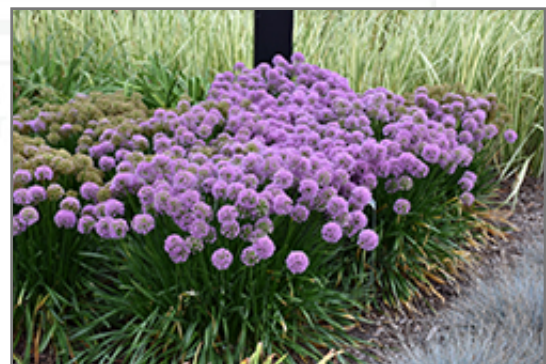
Millenium Ornamental Onion in bloom