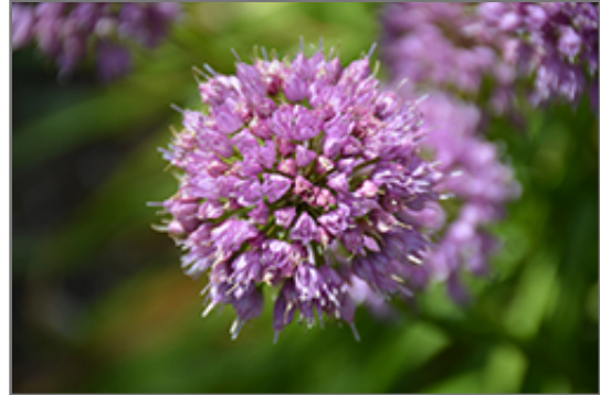
Millenium Ornamental Onion flowers