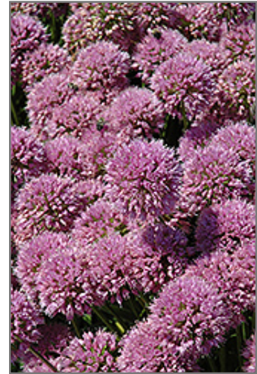
Millenium Ornamental Onion flowers

Millenium Ornamental Onion is an open herbaceous perennial with tall flower stalks held atop a low mound of foliage. Its relatively coarse texture can be used to stand it apart from other garden plants with finer foliage.