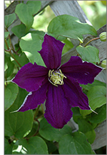
Rhapsody Clematis flowers