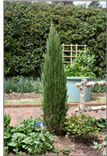
Blue Arrow Juniper