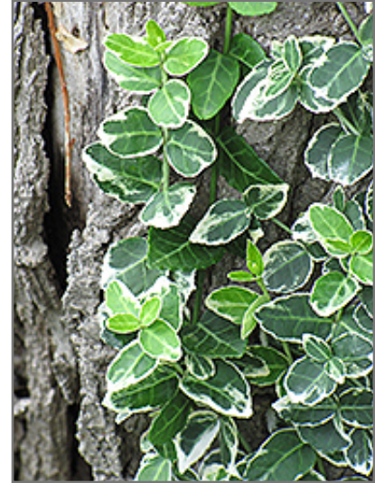
Emerald Gaiety Wintercreeper foliage