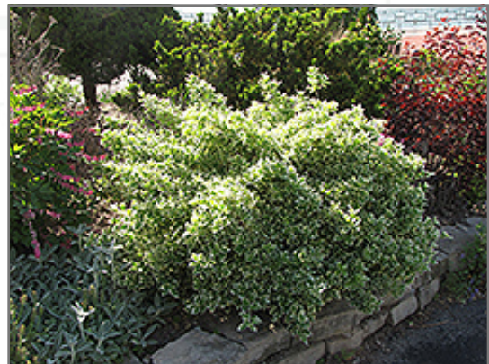
Emerald Gaiety Wintercreeper