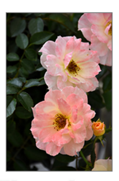
Oso Easy Italian Ice Rose flowers

An amazing rose, blooming all season with abundant soft yellow flowers with bright pink edges; a low mounding habit makes it perfect for the garden, along walks, or as an informal hedge; all roses need full sun and well-drained soil