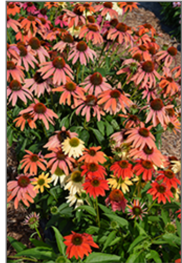
Cheyenne Spirit Coneflower in bloom

Cheyenne Spirit Coneflower is an herbaceous perennial with an upright spreading habit of growth. Its medium texture blends into the garden, but can always be balanced by a couple of finer or coarser plants for an effective composition.