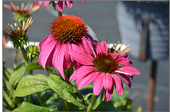
Cheyenne Spirit Coneflower flowers