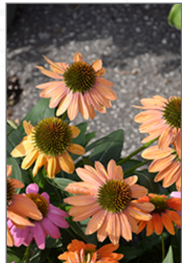
Cheyenne Spirit Coneflower flowers