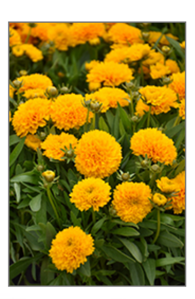
Solanna Golden Sphere Tickseed flowers

This plant should only be grown in full sunlight. It does best in average to evenly moist conditions, but will not tolerate standing water. It is not particular as to soil pH, but grows best in poor soils. It is somewhat tolerant of urban pollution. This is a selection of a native North American species. It can be propagated by division; however, as a cultivated variety, be aware that it may be subject to certain restrictions or prohibitions on propagation.