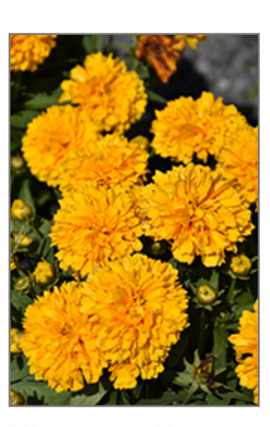
Solanna Golden Sphere Tickseed flowers

Striking, pom-pom like golden blooms; an abundance of large diameter flowers over mounds of dark gray-green foliage; tolerant of pests and drier soils, thriving in sandy and rocky soils