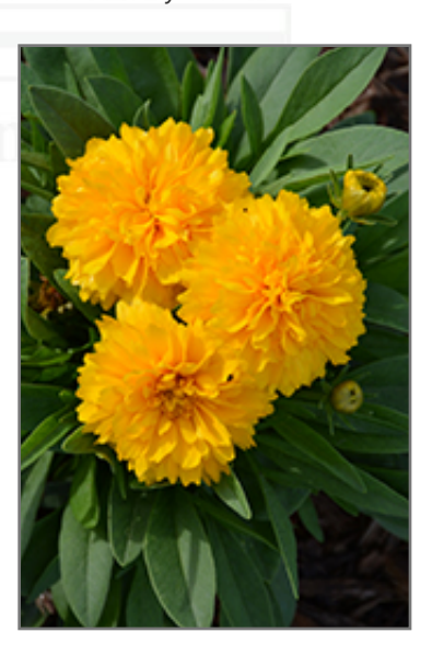
Solanna Golden Sphere Tickseed flowers

Solanna Golden Sphere Tickseed is recommended for the following landscape applications;