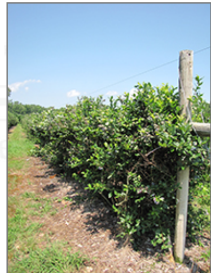
Patriot Blueberry fruit