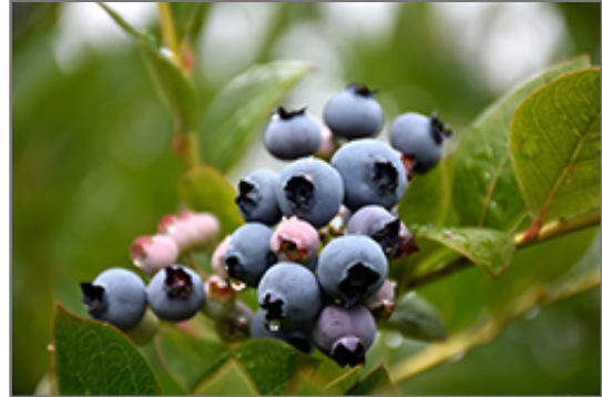
Patriot Blueberry fruit