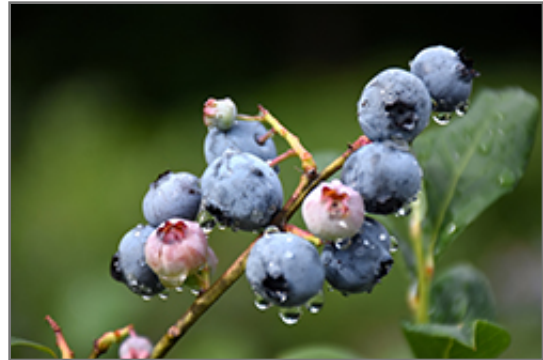
Blueray Blueberry fruit