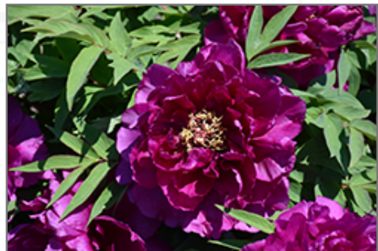
Shimadaijin Tree Peony flowers