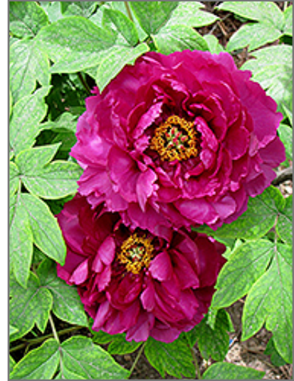
Shimadaijin Tree Peony flowers

Shimadaijin Tree Peony is a multi-stemmed deciduous shrub with an upright spreading habit of growth. Its relatively fine texture sets it apart from other landscape plants with less refined foliage.