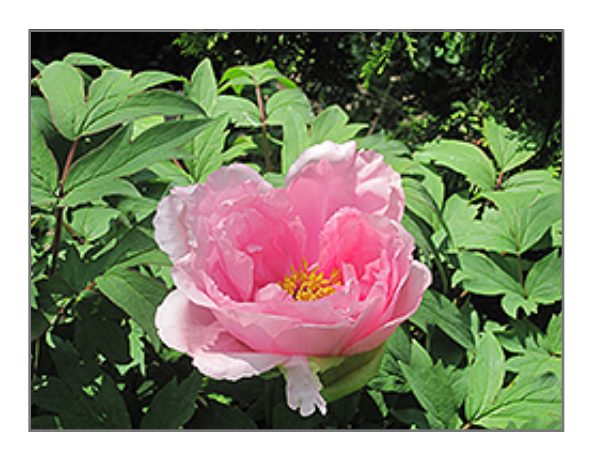
Hanakisoi Tree Peony flowers

A beautiful woody peony for the garden, presenting lovely pink blooms with yellow stamens; great as an accent in the garden or massed in borders; unlike perennial peonies, remember not to prune this variety