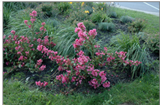
Sonic Bloom Pink Reblooming Weigela in bloom