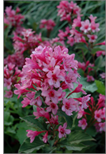
Sonic Bloom Pink Reblooming Weigela flowers

This shrub will require occasional maintenance and upkeep, and should only be pruned after flowering to avoid removing any of the current season's flowers. It is a good choice for attracting hummingbirds to your yard. It has no significant negative characteristics.