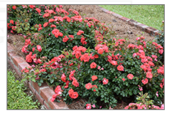
Coral Drift Rose in bloom