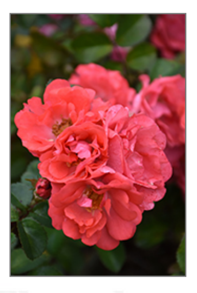
Coral Drift Rose flowers

This shrub will require occasional maintenance and upkeep, and is best pruned in late winter once the threat of extreme cold has passed. It is a good choice for attracting bees to your yard. It has no significant negative characteristics.