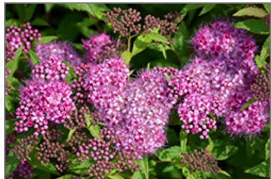
Anthony Waterer Spirea flowers