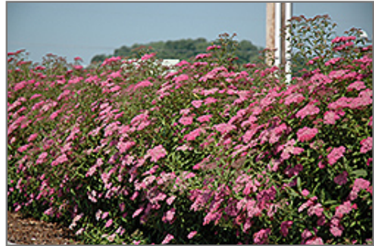
Anthony Waterer Spirea in bloom

Anthony Waterer Spirea is recommended for the following landscape applications;