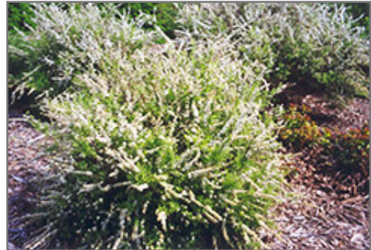
Dwarf Garland Spirea in bloom

Dwarf Garland Spirea will grow to be about 4 feet tall at maturity, with a spread of 3 feet. It tends to fill out right to the ground and therefore doesn't necessarily require facer plants in front. It grows at a fast rate, and under ideal conditions can be expected to live for approximately 20 years.