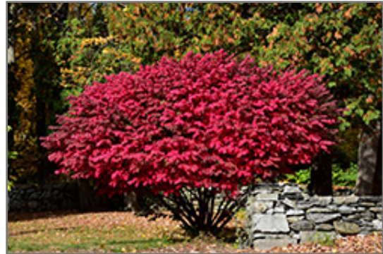
Winged Burning Bush in fall

This is a relatively low maintenance shrub, and can be pruned at anytime. It has no significant negative characteristics.