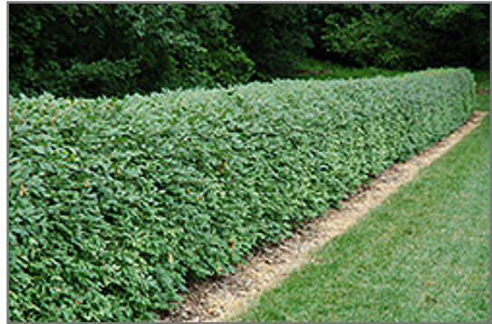
Winged Burning Bush

Winged Burning Bush will grow to be about 10 feet tall at maturity, with a spread of 10 feet. It tends to fill out right to the ground and therefore doesn't necessarily require facer plants in front, and is suitable for planting under power lines. It grows at a slow rate, and under ideal conditions can be expected to live for 50 years or more.