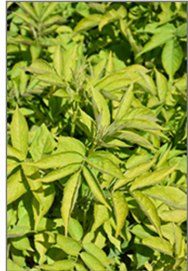
Golden American Elder foliage