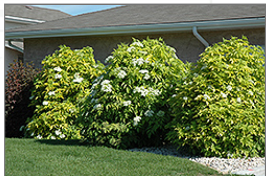
Golden American Elder in bloom