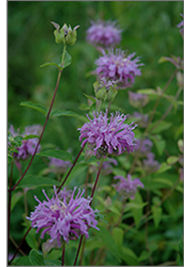
Wild Beebalm flowers

Wild Beebalm is recommended for the following landscape applications;