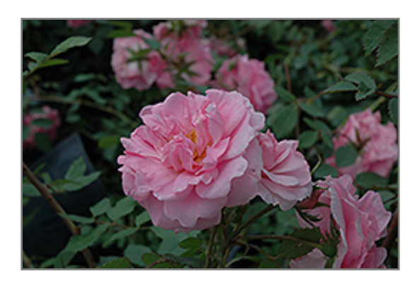
John Davis Rose flowers

John Davis Rose is smothered in stunning fragrant semi-double pink flowers with yellow eyes along the branches from late spring to late summer. The flowers are excellent for cutting. It has dark green deciduous foliage. The oval compound leaves turn yellow in fall. The spiny brick red bark and brick red branches add an interesting dimension to the landscape.