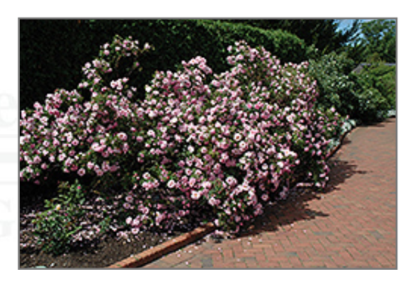
John Davis Rose in bloom