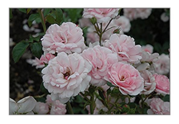
Bonica Rose flowers

Bonica Rose is a multi-stemmed deciduous shrub with an upright spreading habit of growth. Its average texture blends into the landscape, but can be balanced by one or two finer or coarser trees or shrubs for an effective composition.