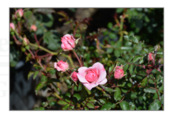
Bonica Rose flower buds

This is a high maintenance shrub that will require regular care and upkeep, and is best pruned in late winter once the threat of extreme cold has passed. Gardeners should be aware of the following characteristic(s) that may warrant special consideration;