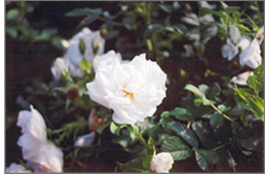
Blanc Double de Coubert Rose flowers

Blanc Double de Coubert Rose is recommended for the following landscape applications;