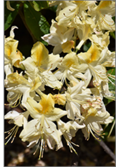
Northern Hi-Lights Azalea flowers