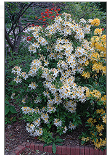
Northern Hi-Lights Azalea in bloom