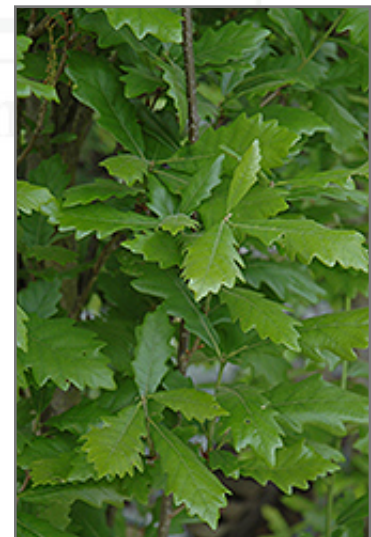
Regal Prince English Oak foliage