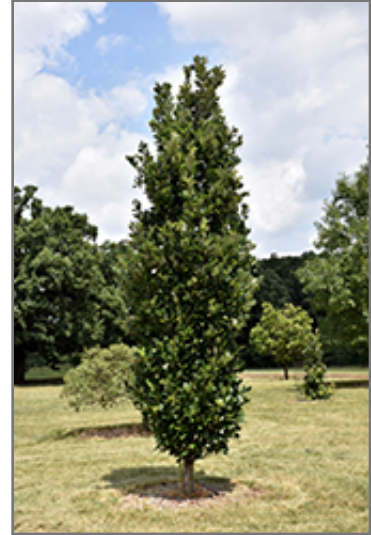
Regal Prince English Oak