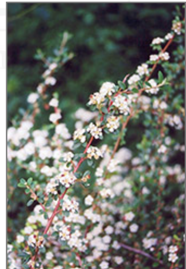
Bearberry Cotoneaster flowers