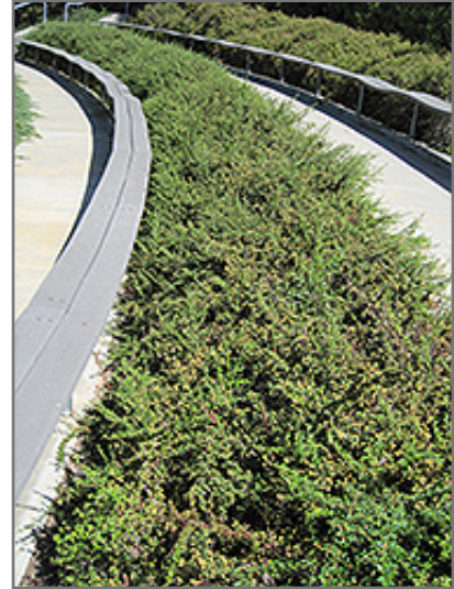
Bearberry Cotoneaster