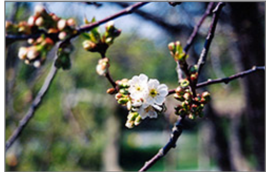
Montmorency Cherry flowers

Montmorency Cherry is clothed in stunning clusters of fragrant white flowers along the branches in mid spring before the leaves. It has dark green deciduous foliage. The pointy leaves turn an outstanding orange in the fall. The fruits are showy cherry red drupes carried in abundance in mid summer. The fruit can be messy if allowed to drop on the lawn or walkways, and may require occasional clean-up. The smooth dark red bark adds an interesting dimension to the landscape.