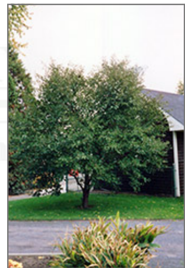
Montmorency Cherry