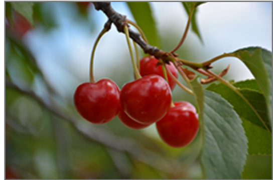
Montmorency Cherry fruit