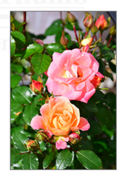
Peach Drift Rose flowers