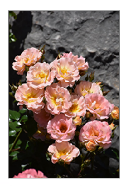
Peach Drift Rose flowers

This is a high maintenance shrub that will require regular care and upkeep, and is best pruned in late winter once the threat of extreme cold has passed. It is a good choice for attracting bees and butterflies to your yard. Gardeners should be aware of the following characteristic(s) that may warrant special consideration;