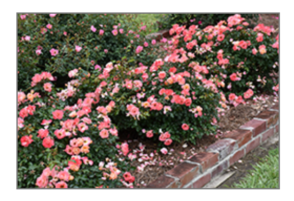
Peach Drift Rose in bloom

Peach Drift Rose will grow to be about 18 inches tall at maturity, with a spread of 24 inches. It tends to fill out right to the ground and therefore doesn't necessarily require facer plants in front. It grows at a fast rate, and under ideal conditions can be expected to live for approximately 20 years.