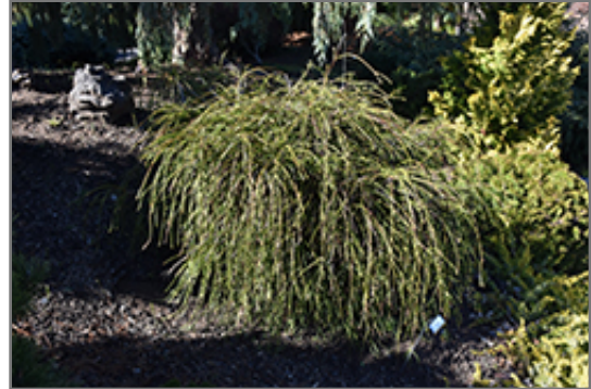
Whipcord Arborvitae

Whipcord Arborvitae will grow to be about 5 feet tall at maturity, with a spread of 5 feet. It tends to fill out right to the ground and therefore doesn't necessarily require facer plants in front, and is suitable for planting under power lines. It grows at a slow rate, and under ideal conditions can be expected to live for 50 years or more.