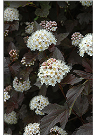
Diablo Ninebark flowers

Diablo Ninebark is a multi-stemmed deciduous shrub with an upright spreading habit of growth. Its relatively coarse texture can be used to stand it apart from other landscape plants with finer foliage.