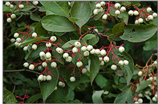
Gray Dogwood fruit

Gray Dogwood is recommended for the following landscape applications;