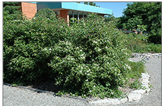
Gray Dogwood in bloom