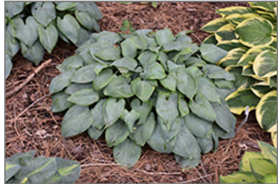
Fragrant Blue Hosta