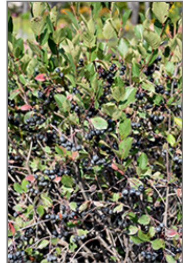
Black Chokeberry fruit

Black Chokeberry is recommended for the following landscape applications;