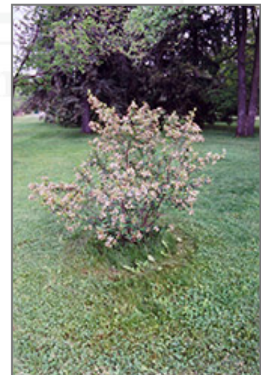
Black Chokeberry in bloom