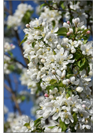
Dolgo Apple flowers

This tree is typically grown in a designated area of the yard because of its mature size and spread. It should only be grown in full sunlight. It prefers to grow in average to moist conditions, and shouldn't be allowed to dry out. It is not particular as to soil type or pH. It is highly tolerant of urban pollution and will even thrive in inner city environments. This particular variety is an interspecific hybrid.