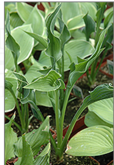
Praying Hands Hosta foliage