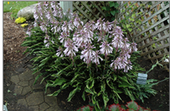
Praying Hands Hosta in bloom