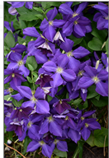
Jackmanii Clematis flowers