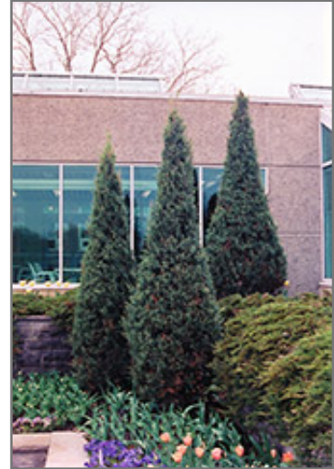
Skyrocket Juniper