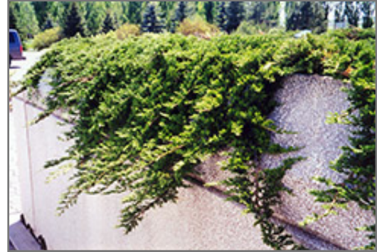
Prince of Wales Juniper

Prince of Wales Juniper is recommended for the following landscape applications;