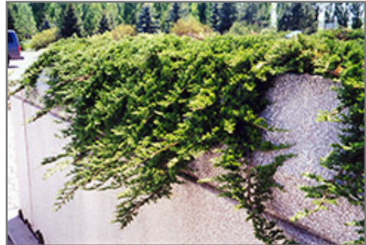
Prince of Wales Juniper

Prince of Wales Juniper is recommended for the following landscape applications;