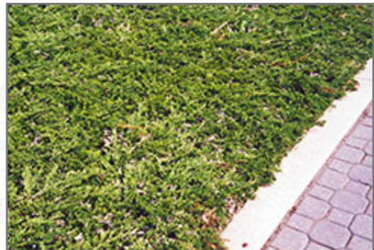
Prince of Wales Juniper