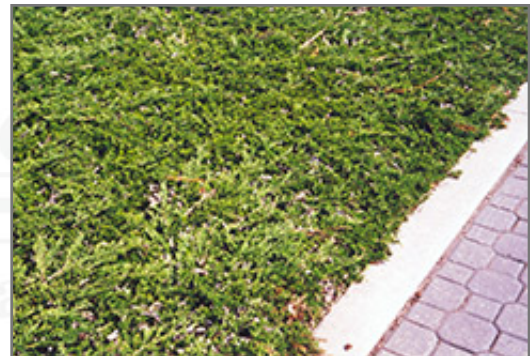
Prince of Wales Juniper