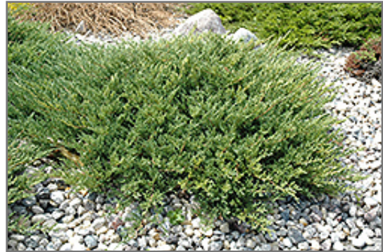
Andorra Juniper