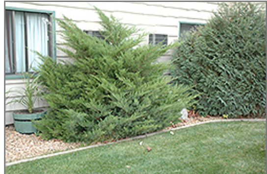
Mint Julep Juniper