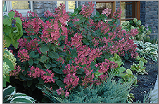
Pink Diamond Hydrangea in fall

Pink Diamond Hydrangea is recommended for the following landscape applications;