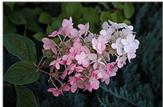
Pink Diamond Hydrangea flowers