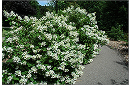
Pink Diamond Hydrangea in bloom

This shrub performs well in both full sun and full shade. It prefers to grow in average to moist conditions, and shouldn't be allowed to dry out. It is not particular as to soil type or pH. It is highly tolerant of urban pollution and will even thrive in inner city environments. Consider applying a thick mulch around the root zone in winter to protect it in exposed locations or colder microclimates. This is a selected variety of a species not originally from North America.