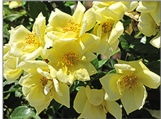
Flower Carpet Yellow Rose flowers