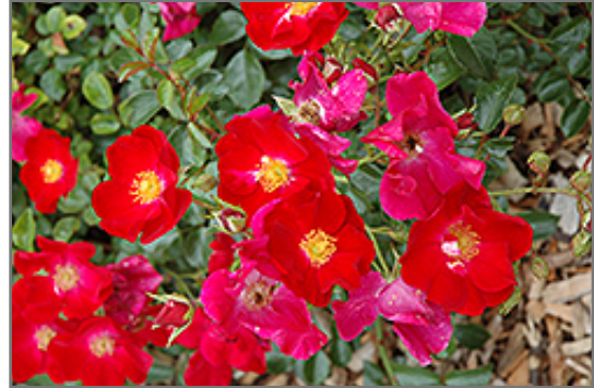
Flower Carpet Red Rose flowers

Flower Carpet Red Rose is a dense multi-stemmed deciduous shrub with an upright spreading habit of growth. Its average texture blends into the landscape, but can be balanced by one or two finer or coarser trees or shrubs for an effective composition.