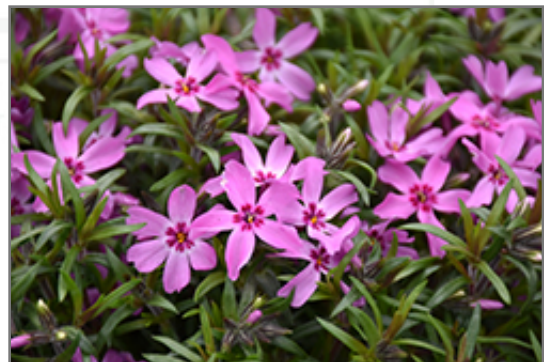
Crimson Beauty Moss Phlox flowers