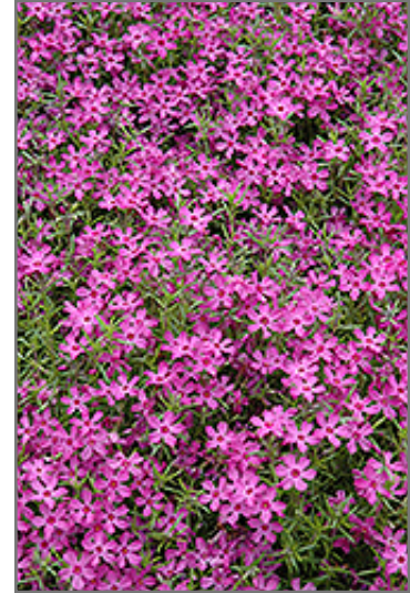
Crimson Beauty Moss Phlox flowers

Crimson Beauty Moss Phlox is a dense herbaceous evergreen perennial with a ground-hugging habit of growth. It brings an extremely fine and delicate texture to the garden composition and should be used to full effect.