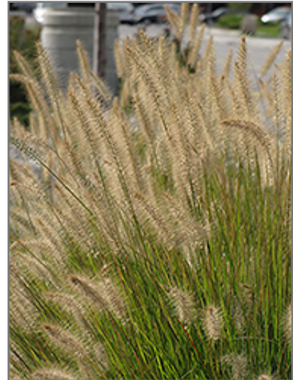
Hamel Dwarf Fountain Grass flowers

Hamel Dwarf Fountain Grass is a fine choice for the garden, but it is also a good selection for planting in outdoor pots and containers. It can be used either as 'filler' or as a 'thriller' in the 'spiller-thriller-filler' container combination, depending on the height and form of the other plants used in the container planting. It is even sizeable enough that it can be grown alone in a suitable container. Note that when growing plants in outdoor containers and baskets, they may require more frequent waterings than they would in the yard or garden. Be aware that in our climate, most plants cannot be expected to survive the winter if left in containers outdoors, and this plant is no exception. Contact our experts for more information on how to protect it over the winter months.