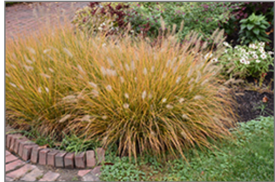
Hameln Dwarf Fountain Grass in fall

This is a relatively low maintenance plant, and is best cleaned up in early spring before it resumes active growth for the season. Deer don't particularly care for this plant and will usually leave it alone in favor of tastier treats. It has no significant negative characteristics.