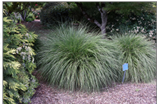
Hameln Dwarf Fountain Grass