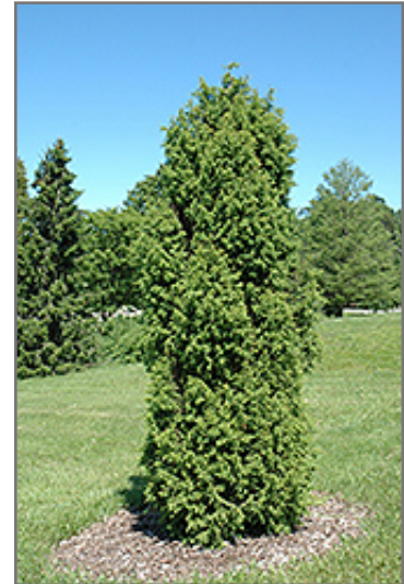
Pencil Point Juniper