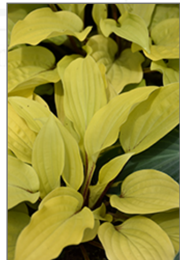
Fire Island Hosta foliage