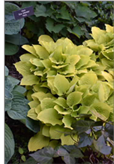
Fire Island Hosta