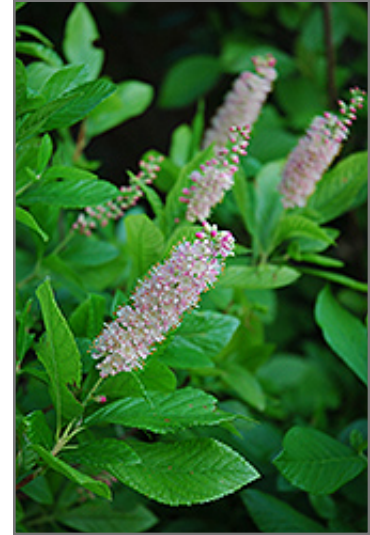
Pink Spires Summersweet flowers