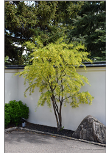
Lorbergii Peashrub in bloom

This shrub will require occasional maintenance and upkeep, and can be pruned at anytime. Gardeners should be aware of the following characteristic(s) that may warrant special consideration;