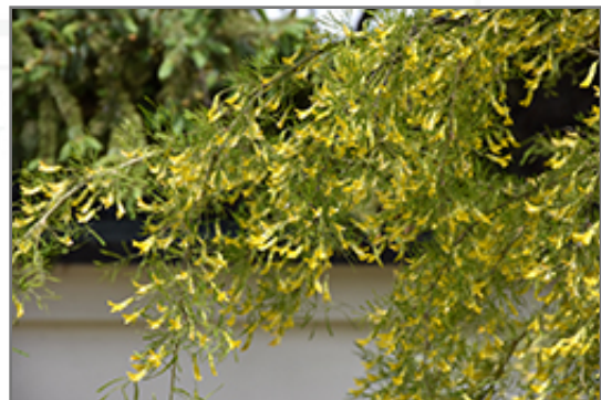
Lorbergii Peashrub flowers