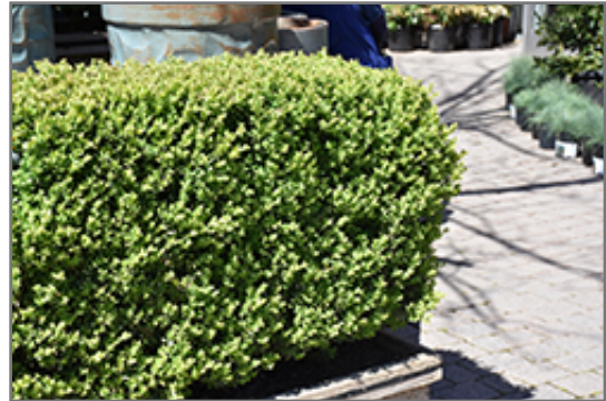
Green Mountain Boxwood

Green Mountain Boxwood is recommended for the following landscape applications;