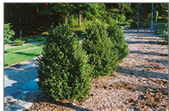
Green Mountain Boxwood